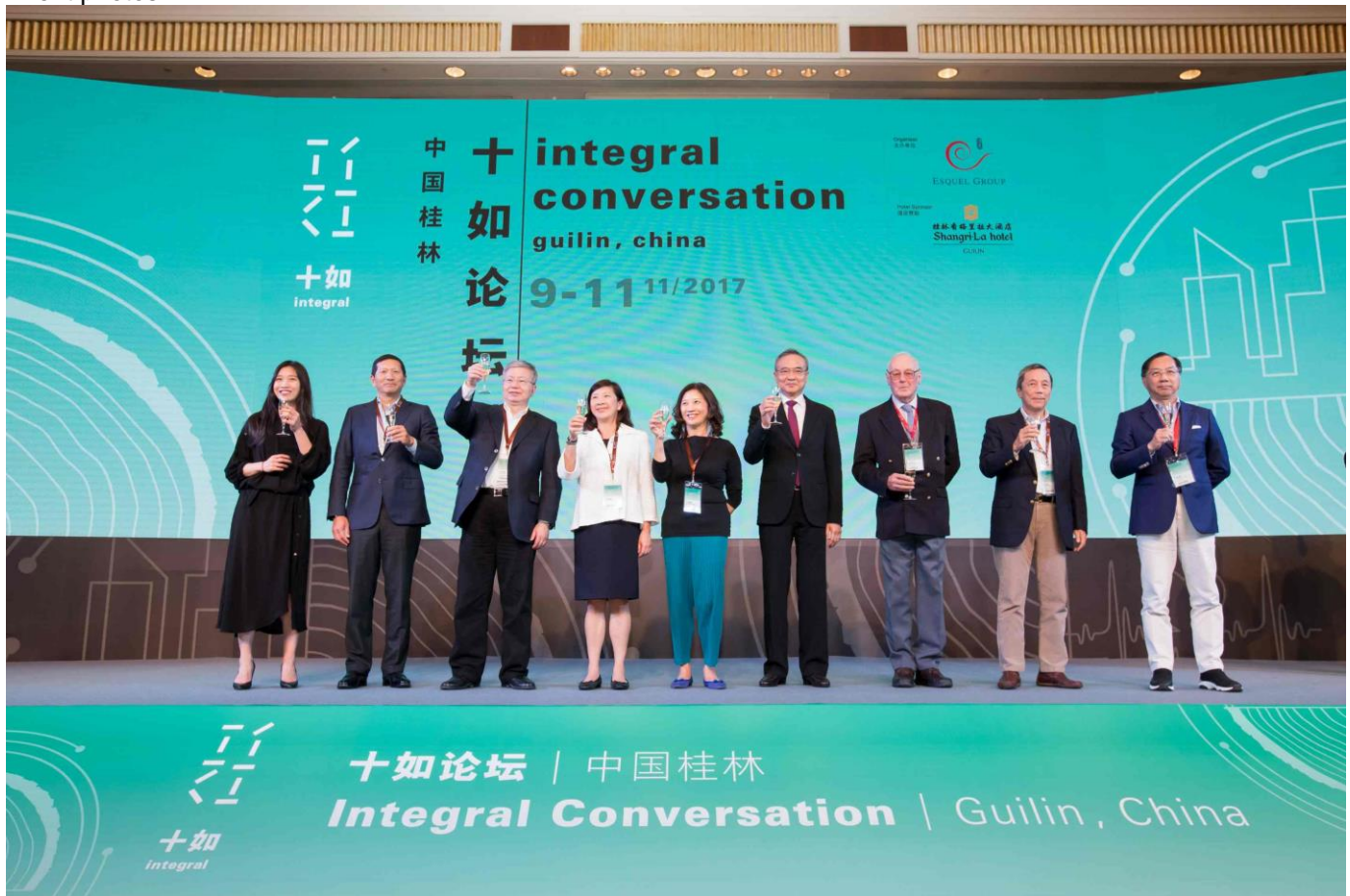
The 2017 Integral Conversation kicked off with a toasting ceremony on the stage.