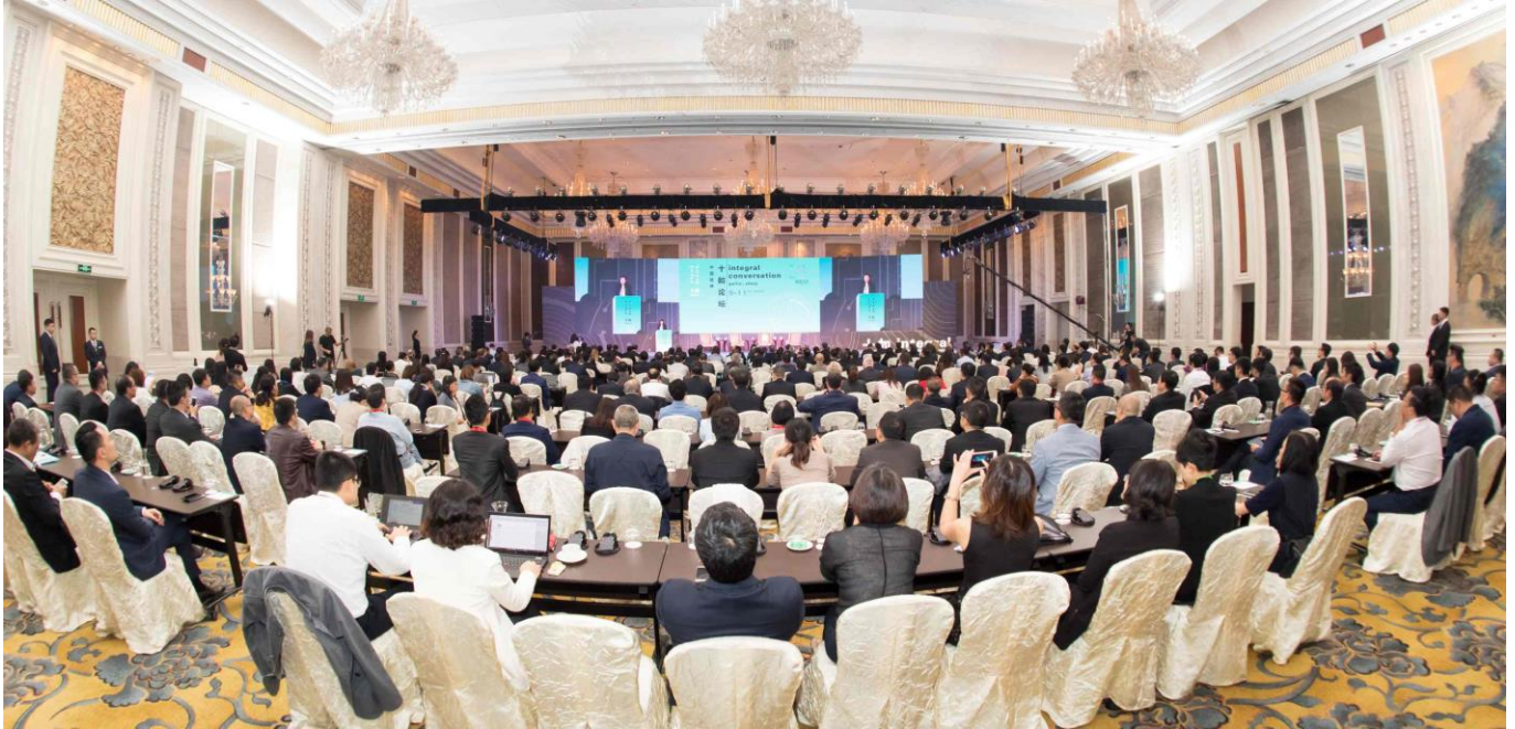
Hosted by Esquel Group, 2017 Integral Conversation comes to a successful end with more than 300 international experts joining the event.