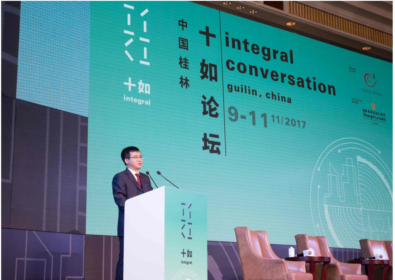
Xinhong Fan, Deputy Mayor of Guilin delivered welcoming remarks.